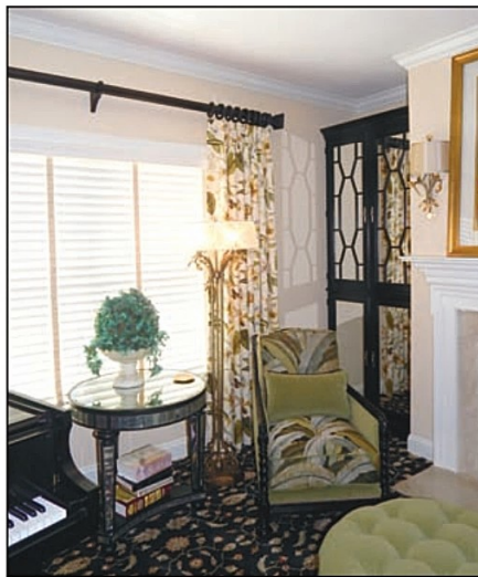
Lots of greens and dark wood colors upgrade a dated parlor.

"The overall effect of this flooring tied the adjoining room colors into this room, as well as giving the room a much larger dimensional perspective," he says.